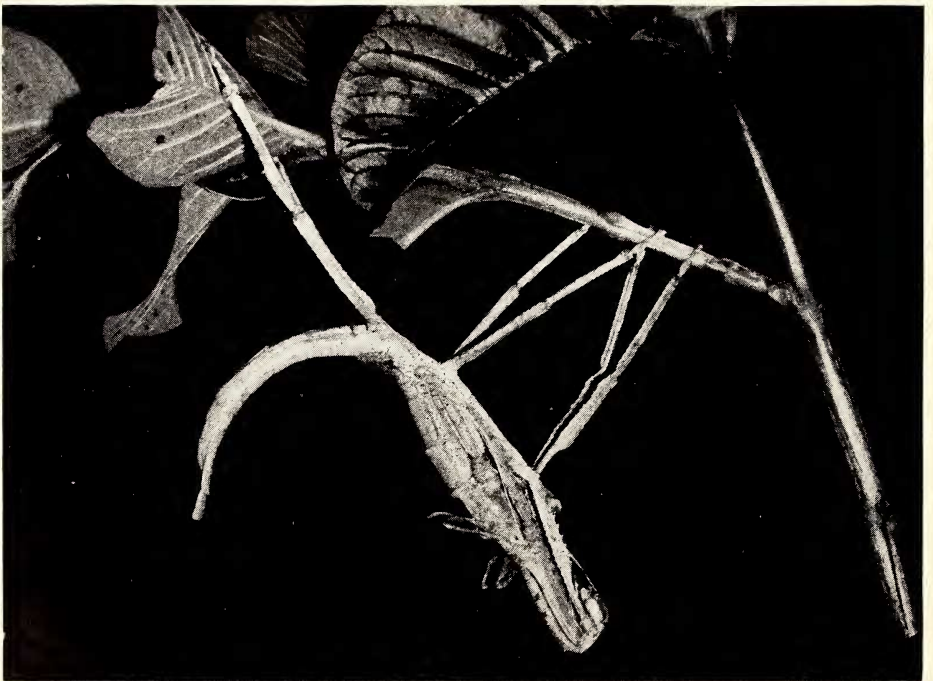
Body coming out of the old skin